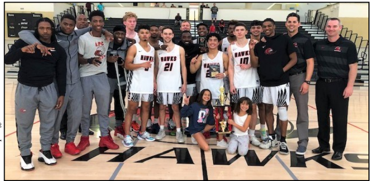
LPC Basketball Team and Coaches at the Tony Costello Tip-Off Classic