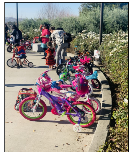
CDC Children participating in the Trike-A-Thon