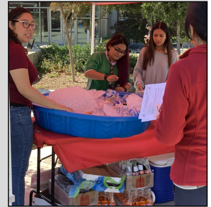
LPC staff and students at Food de Las Americas