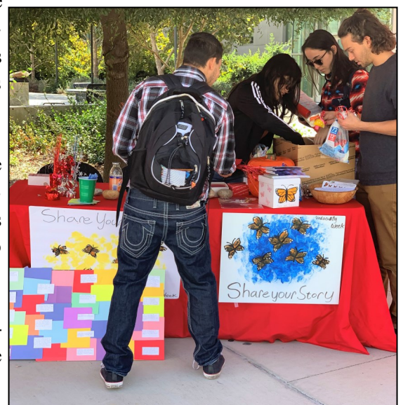
Share your story booth and volunteers.

The DocuAlly Taskforce would like to thank the State Chancellor's Office, the entire Chabot Las Positas Community College District, and the LPC community for supporting the events during this week of action.