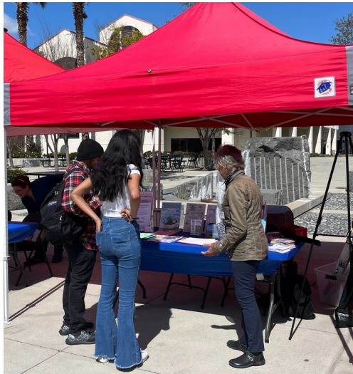
Students learning at the Tri-Valley Air Quality Alliance's booth