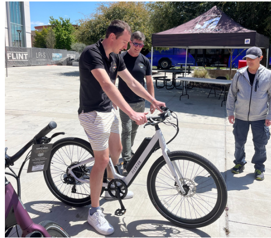
Students were able to test ride eBikes at the Fair