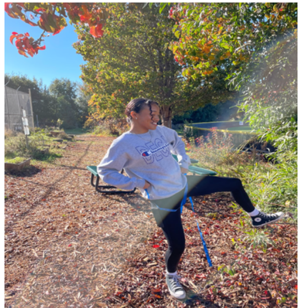
LPSEA at Chabot College helping conduct a tree survey to measure the amount of CO 2 sequestered by trees on campus