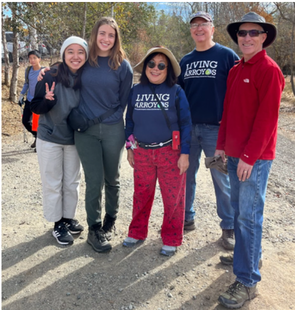
LPSEA at a creek cleanup with Living Arroyos

LPSEA students used GIS mapping software to determine the type and quantity of all outdoor receptacles.