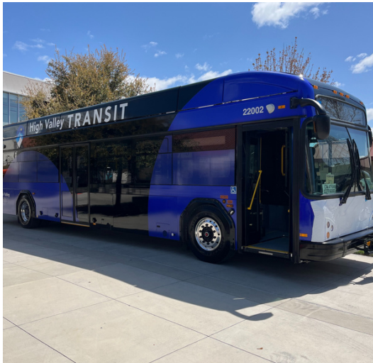
Gillig's new electric transit bus

As part of the LPC Earth Week celebrations, LPCCAW and LPSEA organized the Second Annual Climate Solutions Fair in the Quad. Students were able to go inside a brand new electric bus, test ride eBikes from local bike shops, buy tomato plants from the Horticulture team, and learn about solutions to the climate crisis from LPSEA, Gillig, and the Tri-Valley Air Quality Alliance. You can read more about the event in this LPC Express News article .