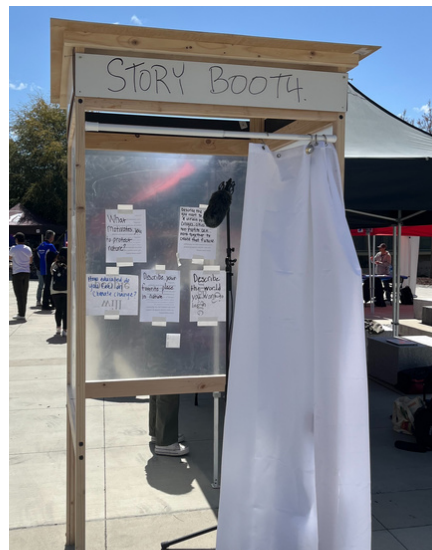
Story Booth that recorded student's thoughts on their relationship with nature