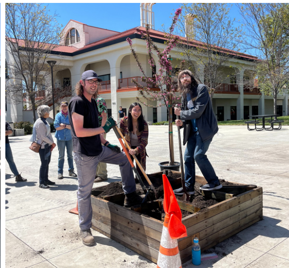
Students helping plant a new Crab Apple tree on campus