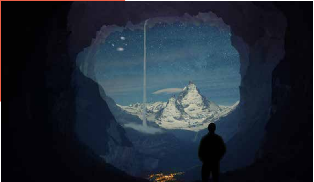
by Benjamin Revell. Photoshop I