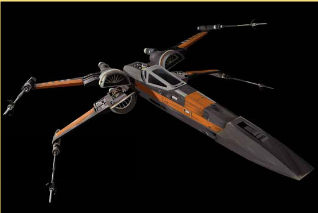
by Rico Busalpa. Illustrator I.

Students will build upon the fundamental techniques of digital painting. Students will create paintings from references as well as from imagination, paying close attention to lighting and color. Course will focus on development of style for commercial illustration.