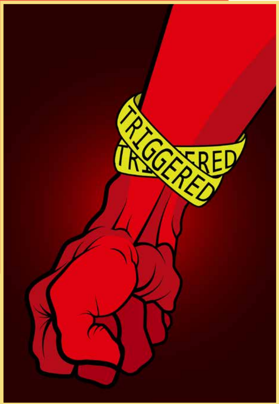
by Natalie Waters. Illustrator 1.