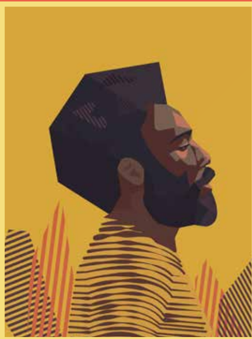
by Chance Owen. Illustrator I .