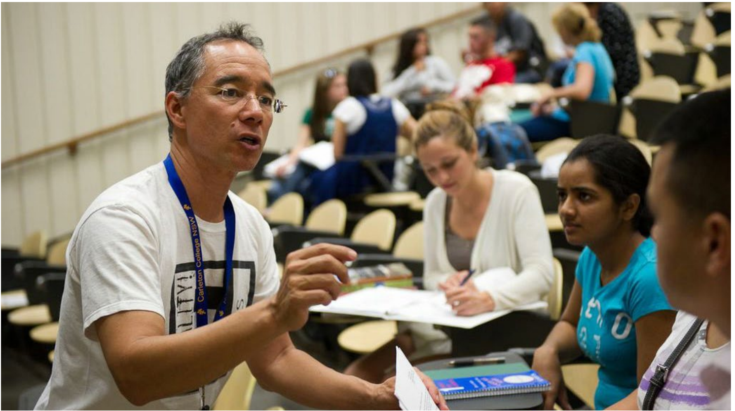
De Anza College