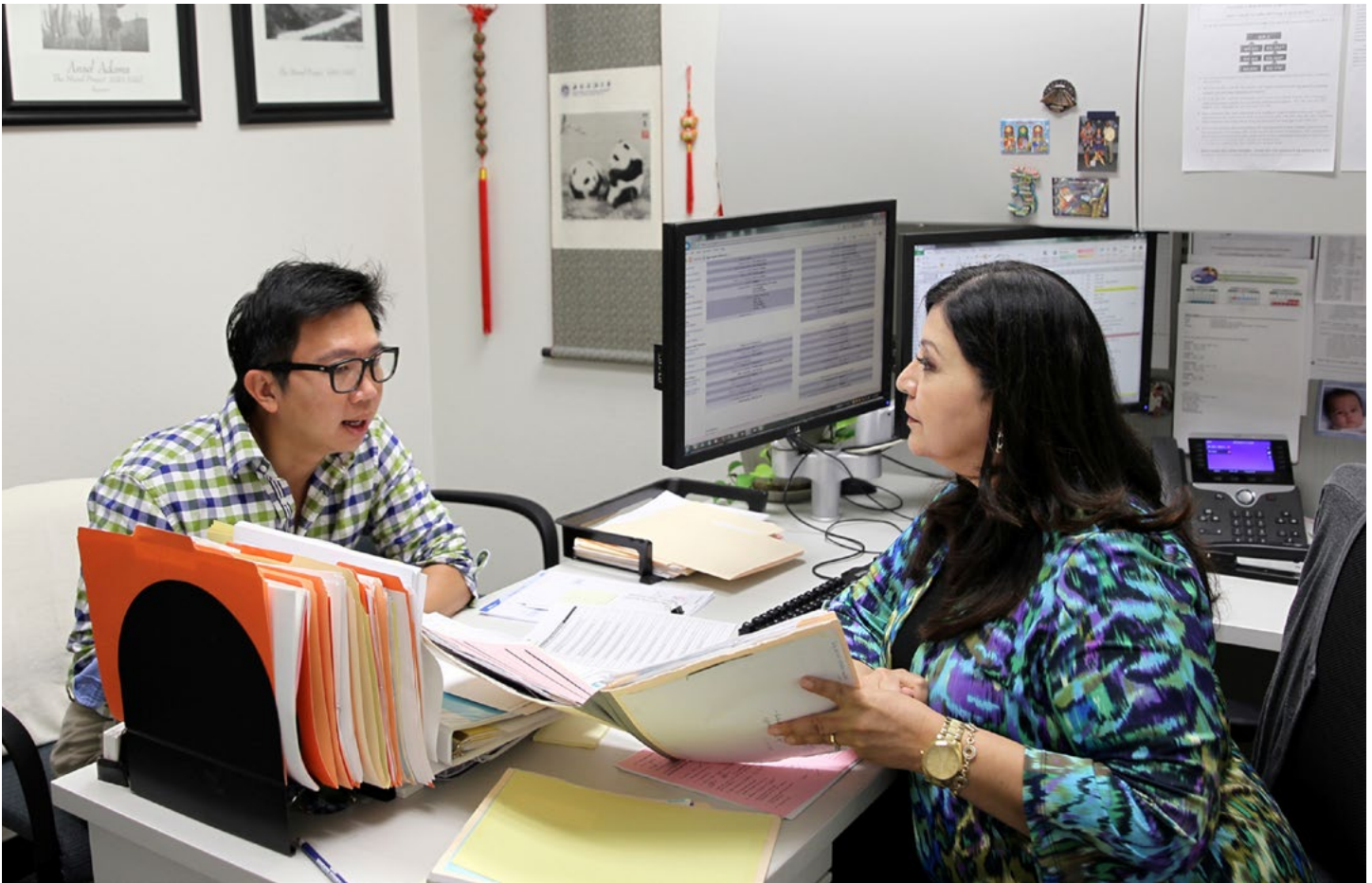
Irvine Valley College

The Academic Senate regularly considers changes to these lists, and recommendations from the Senate to the Board of Governors are developed through active collaboration between the local senates, professional organizations within the state and the Chancellor's Office. The resulting minimum qualifications serve as a statewide benchmark for promoting professionalism and rigor within the academic disciplines in the community colleges and a guideline for day-to-day decisions regarding suitability for employment in the system.