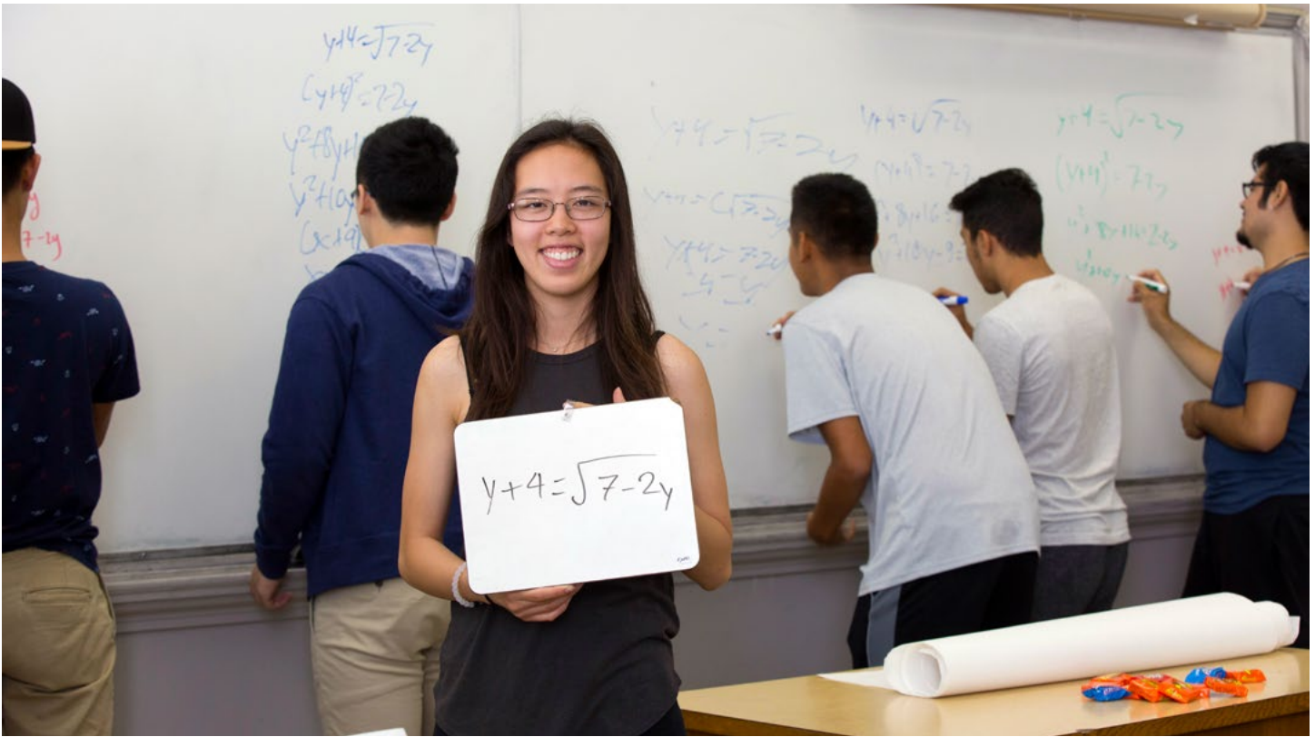
Pasadena City College